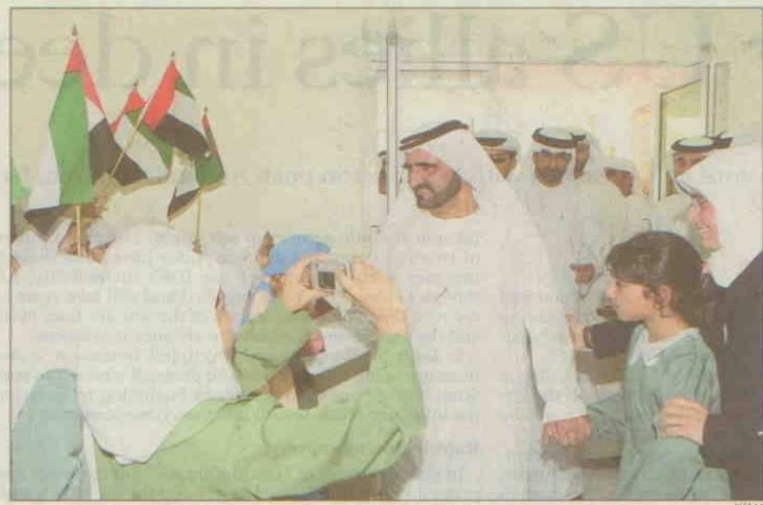
Cheerful welcome Shaikh Mohammad visits Delma Primary School for Girls among four other schools on the island and is enthusiastically greeted by students.